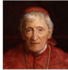
St. John Henry Newman (1801-1890)